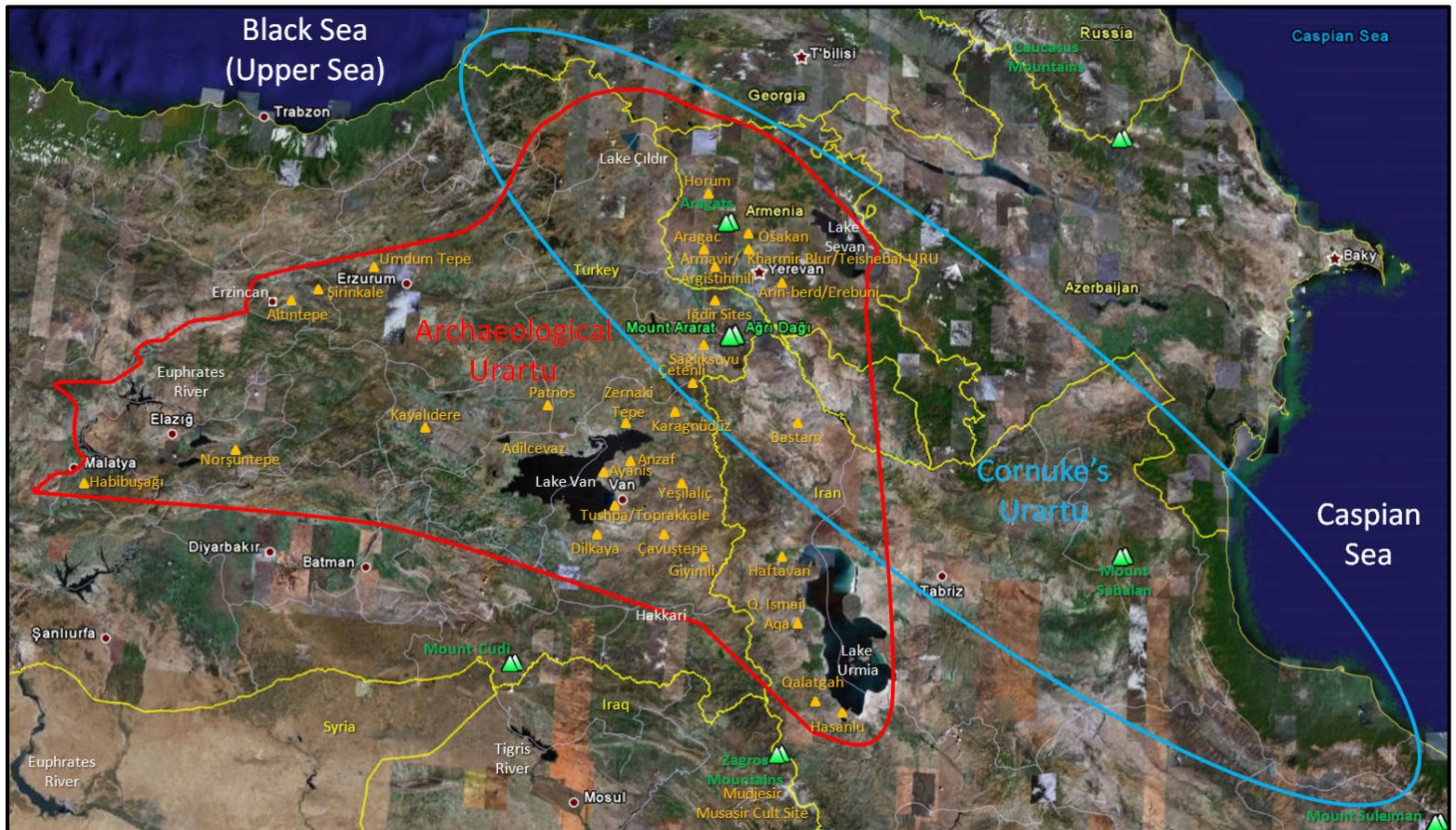
Archaeological Urartu (Red) with Urartian Archaeological Sites (Orange) Compared with Cornuke's Urartu (Blue)

support whatsoever, allowing his map to include some of the northern and central Elburz Mountains close to Mount Suleiman.